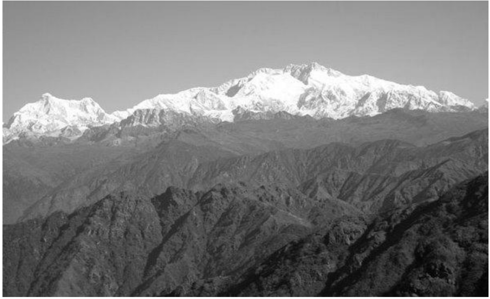
Figure No. 1: View Of Kachenjunga From Darap Village

Darap A Village, Located In The West District Of Sikkim Is Approximately Six Kilometers Away From Tourist Destination, Pelling And Located At The Fringe Of The Kanchenjunga National Park. The Village Of Darap Clings To The Foothills Of The Sikkim Himalaya In The Shadow Of Kanchenjunga Situated At An Altitude 1600 Meters From Mean Sea Level. Darap Village Had Earlier Faced A Lot Of Challenges With Livelihood Where Poverty Was Prevalent And People Were Engaged In Cattle Herding, Poultry And Resource Extraction From Forests Such As Edible Herbs, Timber Felling For Construction, Charcoal And Fuel Wood. Shifting Cultivation Was Also Largely Prevalent And Subsistence.